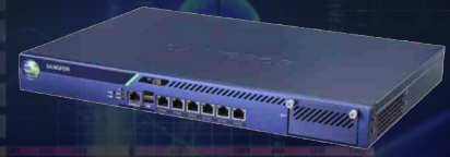
All Pictures shown are for illustration purpose only. Actual Product may vary.

IAG-M5500-SK is the ideal network management solution for Small & Medium Enterprises consists of heavy internet users and eliminate throughput bottleneck. It is also ideal for Branch Deployment.